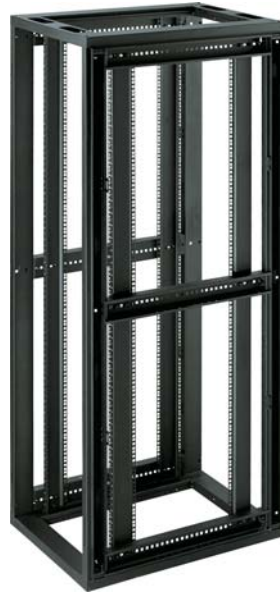
▲ Fully Open Base

► Rolls through a 7 Foot Doorway 42U rack including castors and leveling feet with an overall height of 80inches/ 2,020mm only